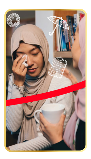
Death and Disability