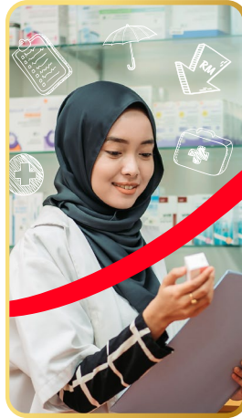
Medical and Hospitalisation